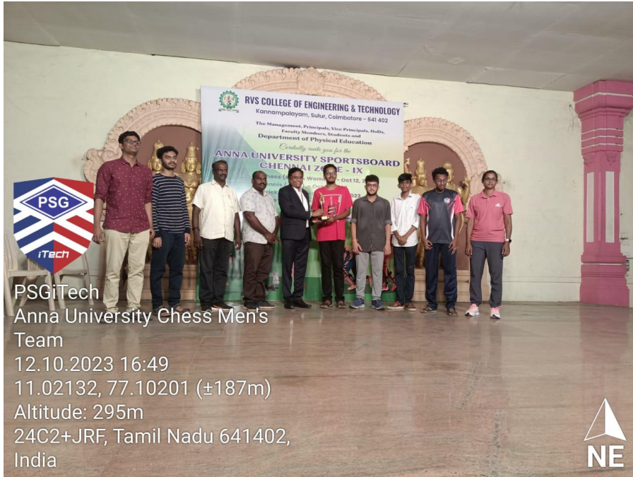
PSGiTech Anna University Chess Men's Team 12.10.2023 16:49 11.02132, 77.10201 (±187m) Altitude: 295m 24C2+JRF, Tamil Nadu 641402, India