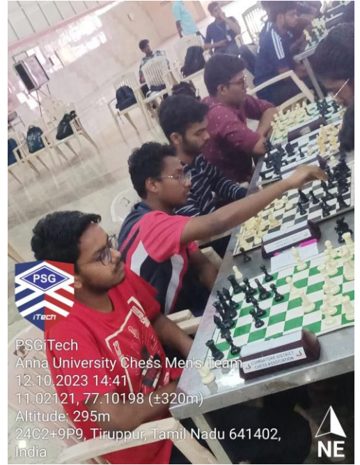
PSGiTech Anna University Chess Men's Team 12.10.2023 14:41 11.02121, 77.10198 (±320m) Altitude: 295m 24C2+9P9, Tiruppur, Tamil Nadu 641402, India